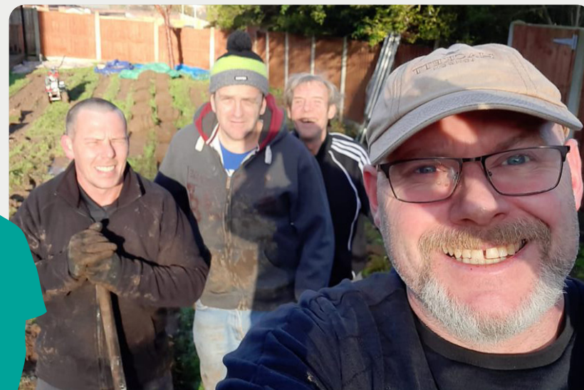
Residents at The Greens Recovery Focused Accommodation in Sheffield redesigning their mindfulness and relaxation garden