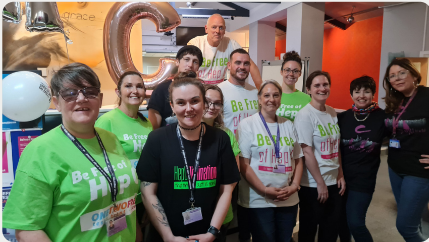
The Calderdale Recovery Steps team launching their 'Be Free of Hep C' campaign

In developing our new strategy, we built a picture of the world around us by undertaking in-depth research, including conversations with people who use our services, our workforce and external stakeholders (commissioners, delivery partners and influencers).