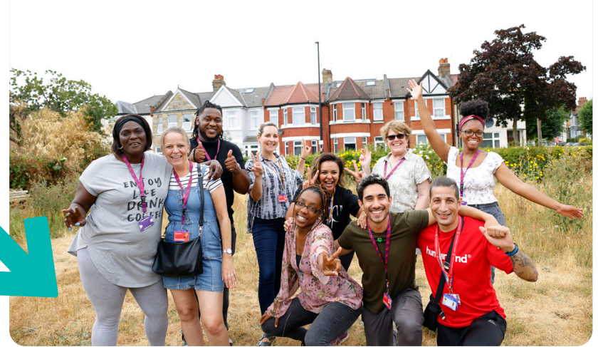
The team at Insight Platform in Haringey