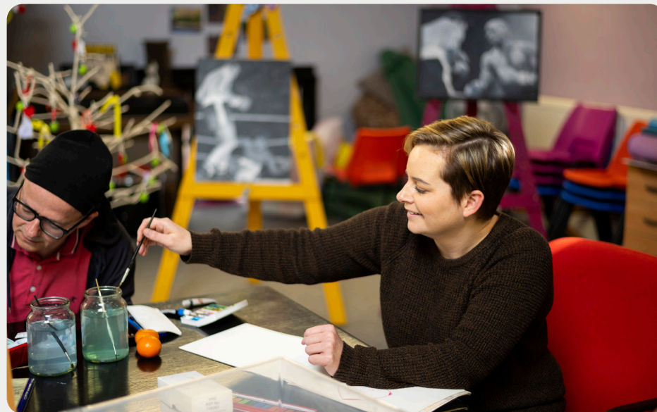
An art class at 5 Ways to Wellbeing, The Recovery Academy in Leeds