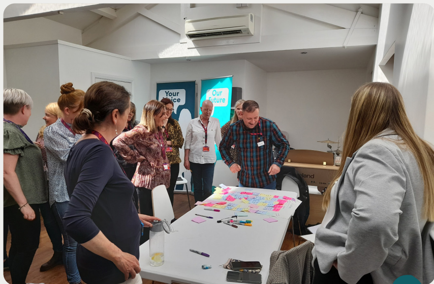
Some of our workforce in Calderdale partake in a workshop for 'Your Voice, Our Future', the consultation phase for developing our new strategy

Our focus and passion is on creating a better future for people and communities who don't have equal access to the resources and opportunities that many people take for granted and who are or risk being affected by drug, alcohol and related issues, limiting their chances even further.