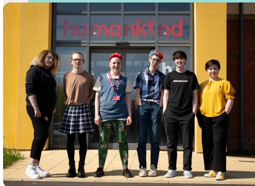
Some of the young people supported by LGBT+ North East.

The new strategy we have created in response captures big ambitions, but is anchored in both why Humankind exists, and what we have proven ourselves capable of achieving.