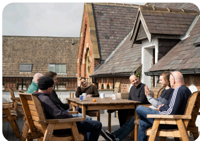
People enjoying the roof terrace at 5 Ways to Wellbeing, the Recovery Academy in Leeds